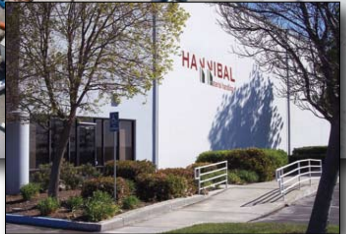
HMH Stockton Facility